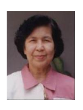
Routine aspects on QA, patient dosimetry Excellent publications in patient safety